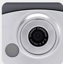
VGA Camera with Flash