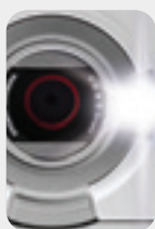
1.3 Megapixel Camera with Flash