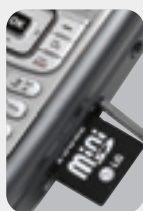
MiniSD External Memory Port MiniSD card sold separately