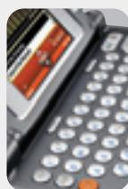
QWERTY Keyboard for Easy Messaging